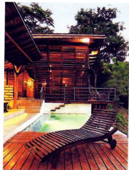
LEFT AND CENTER: ANDREW PERSON; BELOW: CHRIS SAMARA

The development includes a 30-room boutique hotel, similar in style to Morgan's Rock, with a spa, a meeting space, and 100 homesites, which range from one-third of an acre to 16 acres. Prices range from $72,000 to $400,000. On 11 of those sites